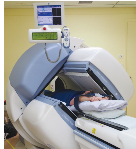
Isotope-detecting gamma cameras and SPECT/CT scanners are used by Nuclear Medicine Physicians to locate the sentinel node.

There will be slight pain at the injection site during and shortly after the tracer injection – the injections may sting about as much as the local anaesthetic you most likely had when the melanoma was removed. You may also experience some redness at the injection site for an hour or so.